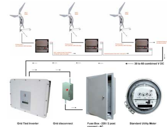
On Grid Connected